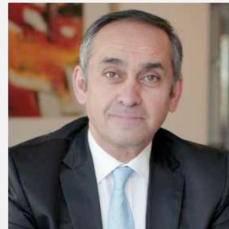
Lord Darzi of Denham