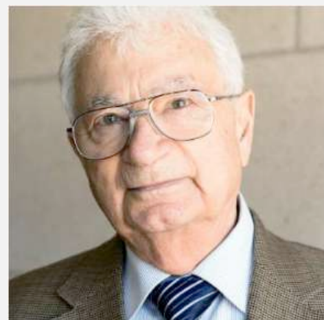
Yuri Oganessian, PhD