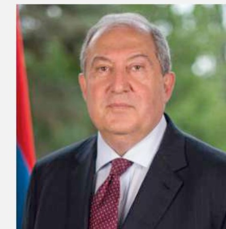
H.E. Armen Sarkissian, PhD