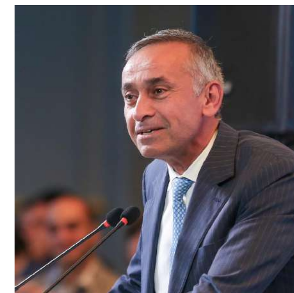
Lord Ara Darzi of Denham

Co-Director, Institute of Global Health Innovation at Imperial College, London UK